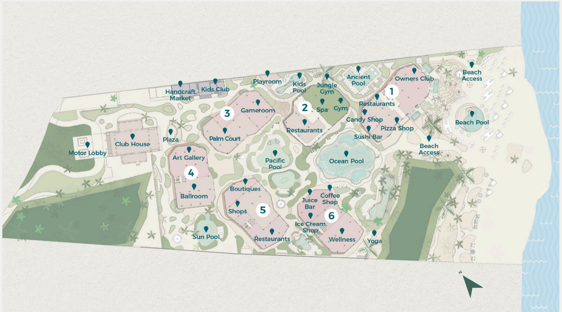
COSTA RESIDENCES & BEACH CLUB MASTER PLAN