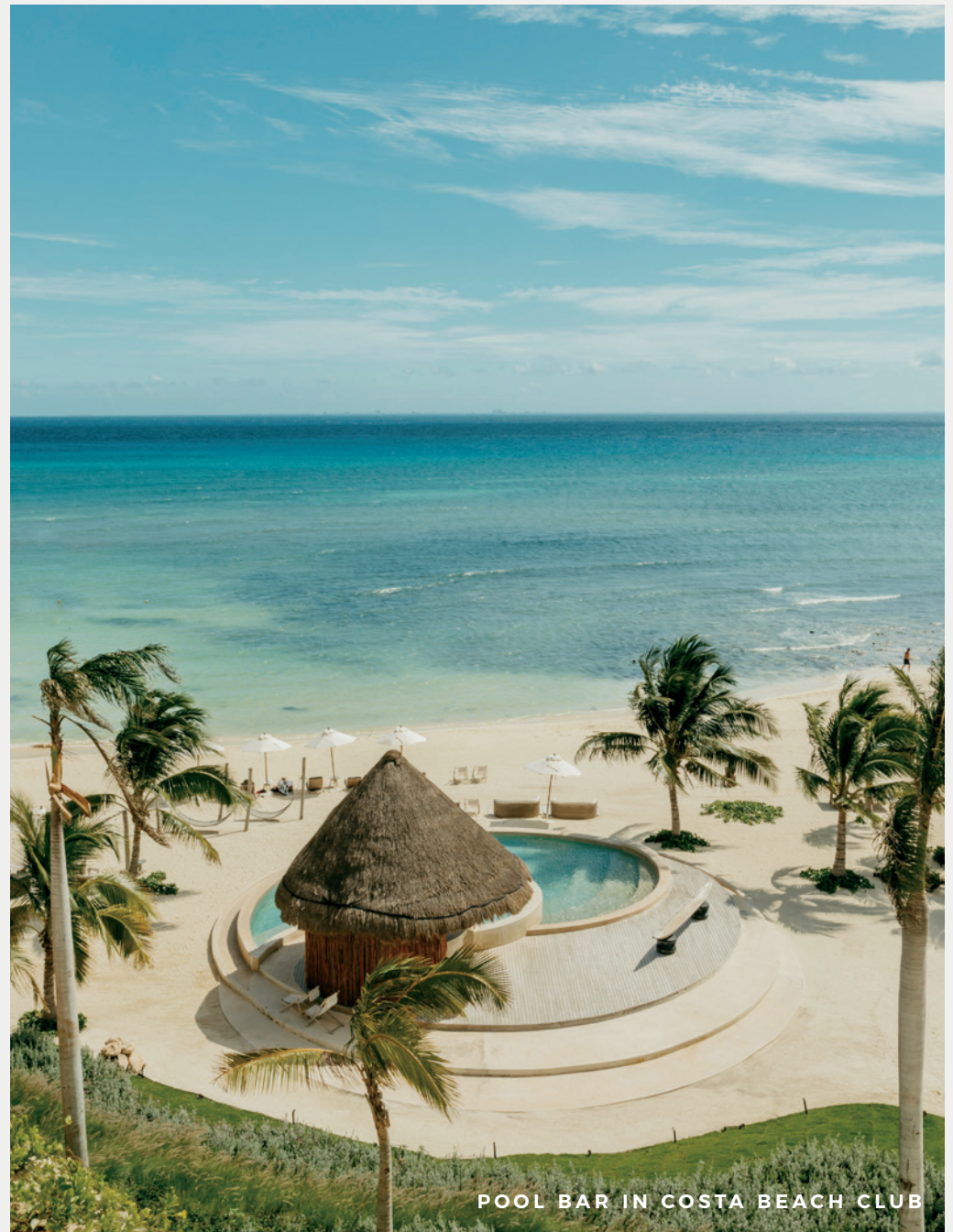
POOL BAR IN COSTA BEACH CLUB